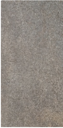
12x24 Matte JSHFDY20-12X24 2x2 Mosaic JSHFDY20-2X2MOS