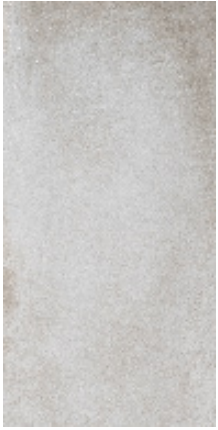
12x24 Matte JSHFDY10-12X24 2x2 Mosaic JSHFDY10-2X2MOS